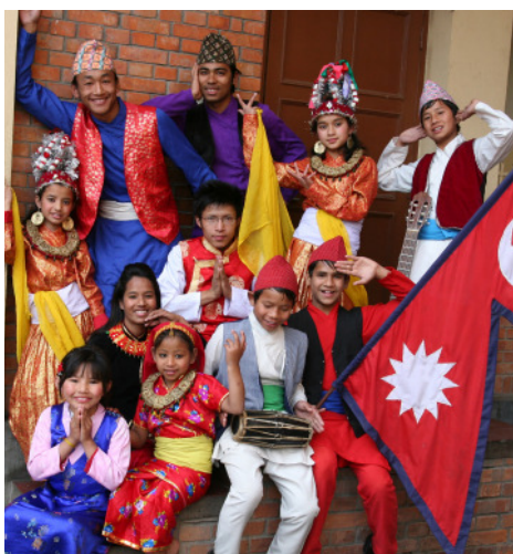
The Dance Tour group