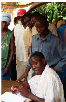
Queuing for help.

Last year's replacement of the Zimbabwean dollar by US and South African currency made it much more difficult for people to survive. Most people are unemployed and as a result have no money. The number of homeless, destitute and despairing people is increasing, often wandering the streets in search of anything that will help them and their families to survive.